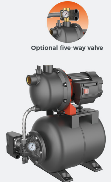
1002PA/PA5 / 1202PA/PA5