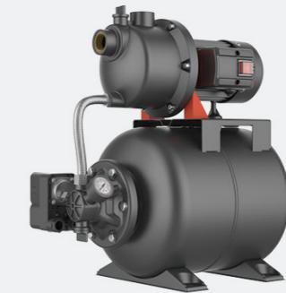
602PA/PA5 / 802PA/PA5