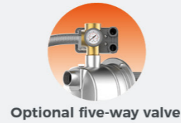
Optional five-way valve