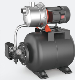
602SA/SA5 / 802SA/SA5