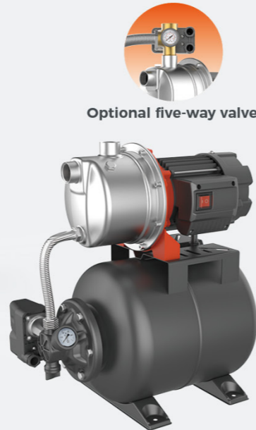
1002SA/SA5 / 1202SA/SA5