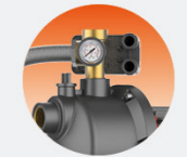
Optional five-way valve